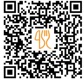
Table 97 Menu

https://menulist.menu 112 N Main St, 46544, Mishawaka, US, United States (+1)5743835811 - https://tbl97.com/