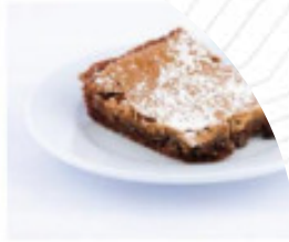
TRIPLE CHOCOLATE GOOEY BUTTE from $ 17.99