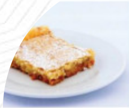
TRADITIONAL GOOEY BUTTER CAKE from $ 17.99