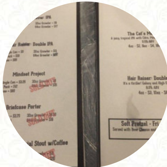
Exhibit 'a' Brewing Company Menu