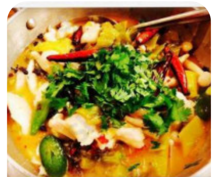
酸菜鱼 Pickled fish