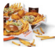
PUB STYLE BASKETS