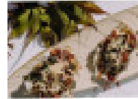
12/17/2019 Standard Oyster Sherry 10/10/20