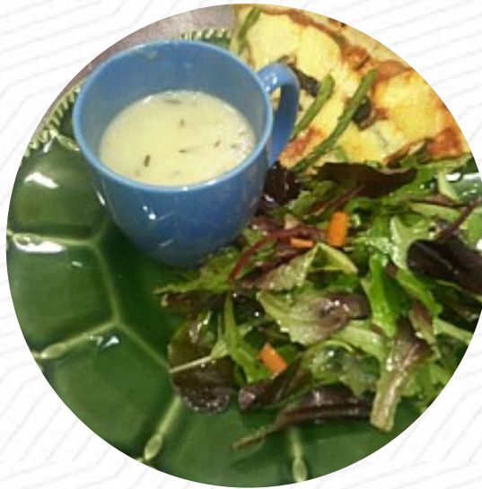
Table Grace Cafe Menu