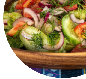
Table Grace Cafe Menu