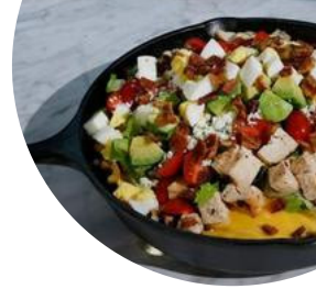
Table 6 Menu