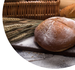
Table25 Fork Wine

7475 Douglas Blvd #112, 30135, Douglasville, US, United States