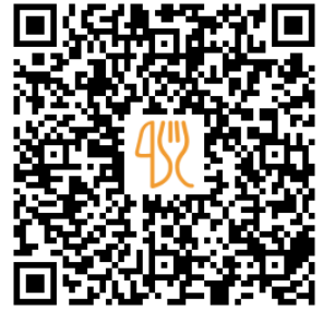
Table25 Fork Wine Menu