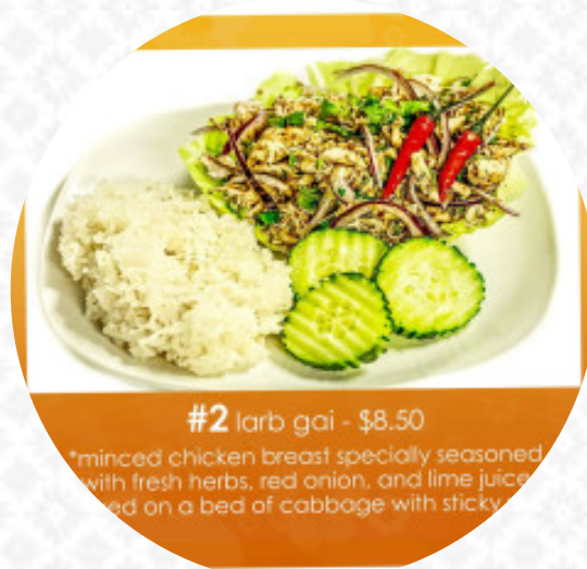
#2 larb gai - $8.50

*minced chicken breast specially seasoned with fresh herbs, red onion, and lime juice served on a bed of cabbage with sticky