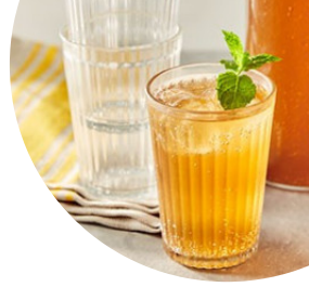
Tavola Trattoria Local

Condominio Da Vinci Local 3 1131 Av. Ashford PR 00907, Old San Juan, United States