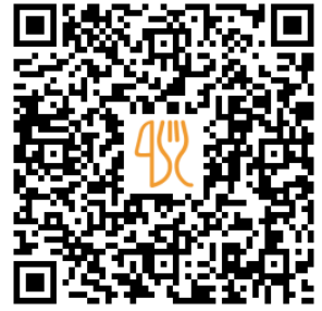
Tavola Trattoria Local Menu